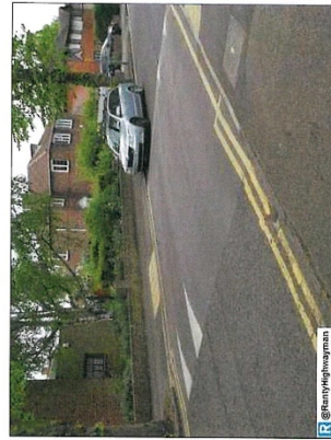
Image of a Traffic Calming Plateau