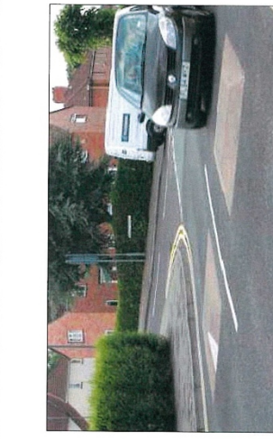
Image of Traffic Calming Cushions

Bradford Council are proposing to introduce traffic calming measures along a length of Wibsey Park Avenue and Farfield Avenue.